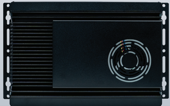
iBX440 top view